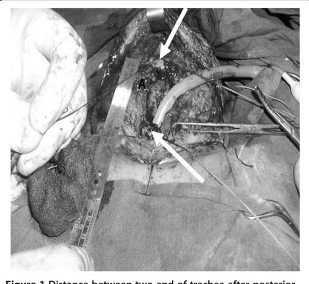
Figure 1 Distance between two end of trachea after posterior and anterior release and suprahyoeid muscle cutting (A).

This study was accomplished in 20 patients. (Table 1 shows patients' characteristics). Prolonged intubation due to head injuries was the etiology of tracheal stenosis in all patients. All patients were discharged from ICU