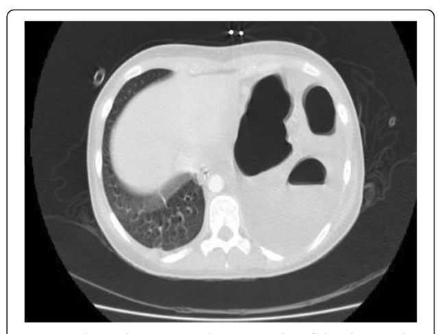
Figure 2 This is the Computed Tomography of the chest and upper abdomen performed after the CXR in Figure 1. It shows distended bowel loops in the thorax.