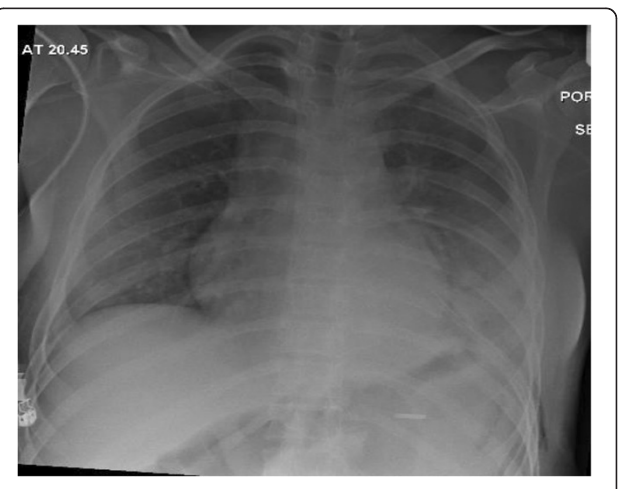
Figure 3 This is the CXR after the diaphragmatic hernia repair. It shows that the bowel contents have been successfully reduced with satisfactory left lung expansion.

Presenting symptoms of late onset CDH could be classified as respiratory (upper respiratory tract infection, pneumonia, respiratory distress, cough, wheezing, etc.),