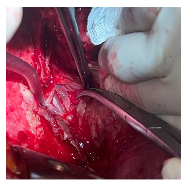
Fig. 2 Intraoperative picture of the esophageal lesion also showing the gastric tube inside the esophagus