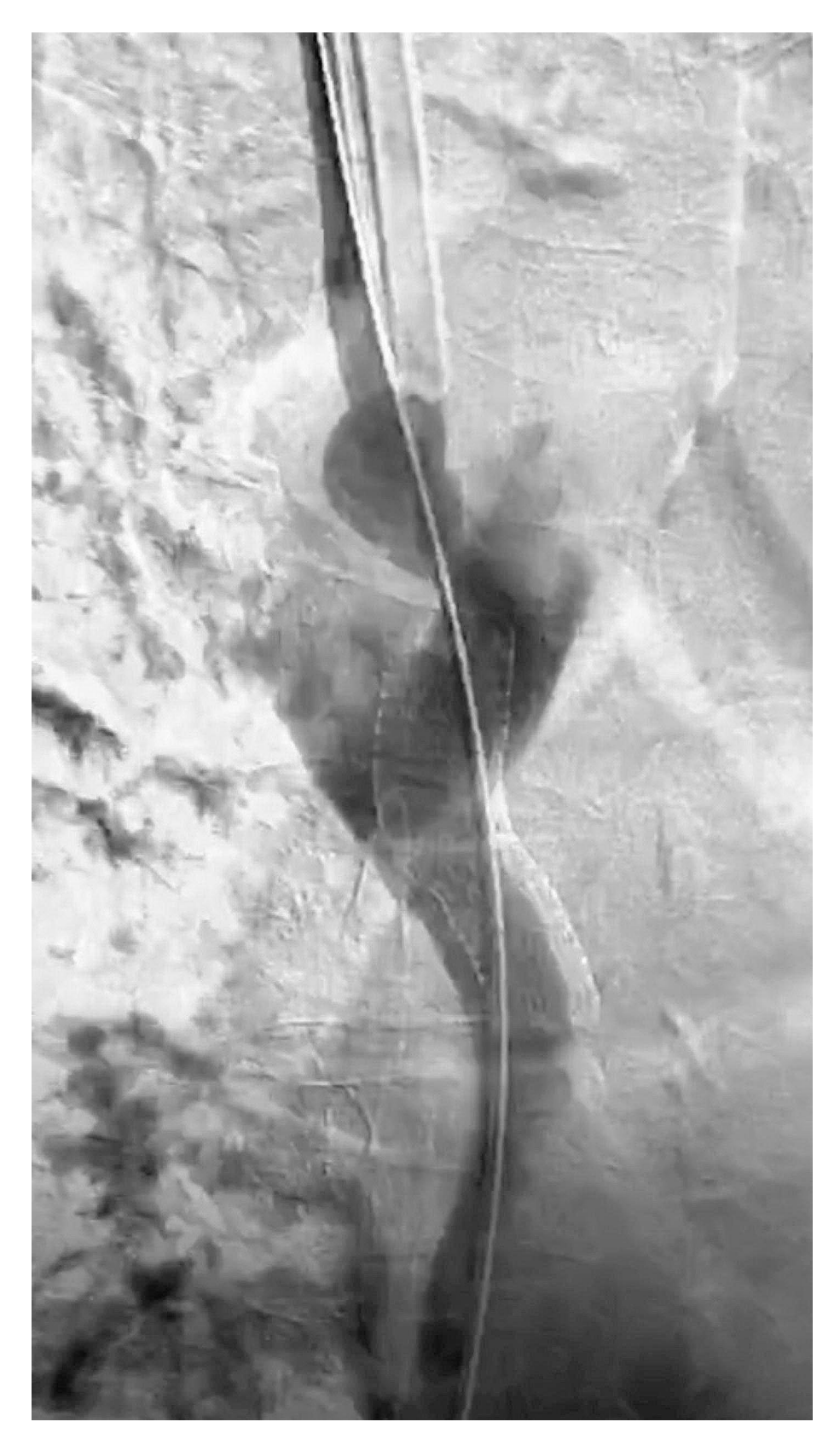
Fig. 2 Blood flow restoration after intervention. Venography conducted through the catheter demonstrated restoration of blood flow in the SVC