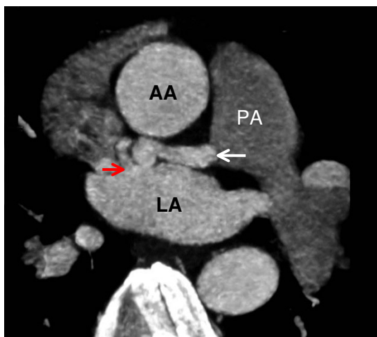
Figure 2 An axial image from an ECG-gated, contrast-enhanced, coronary CT angiogram depicting the fistula (white arrow) running in the atrio-ventricular groove posterior to the ascending aorta (AA) and communicating (red arrow) with the left atrium (LA). Pulmonary artery (PA).

onary arteries (5%)[2]. CAF can be congenital or acquired. Congenital CAF are thought to arise as a result of incomplete embryonic development; normally the coronary arteries communicate with the great vessels and chambers of the heart via sinusoids and during development these