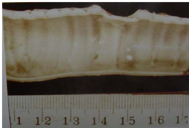
Figure 1 window-shape healed aortic graft on the trachea.

A laparotomy was performed thorough a midline abdominal incision to expose at least 5 cm of infrarenal abdominal aorta. Before aortic clamping, 100-unit/kg heparin was given intravenously and 5 cm of aorta was resected circumferentially and replaced by Dacron graft using a running 4-0 Polypropylene suture. The average time for the harvesting and anastomosis was less than 20 minutes without a need for aortic shunt. The excised aortic segment was placed in heparinized blood solution. The abdomen was then closed in two layers by 0-0, 3-0 nylon sutures. Access to the cervical trachea was gained through a longitudinal vertical neck incision by splitting the anterior neck muscles. The trachea was exposed and a 5 cm long window shape defect is made with resection of anterior tracheal rings. The posterior membranous portion of trachea left intact. A longitudinal incision was made along the whole length of harvested aorta [Fig. 1] and while the endotracheal tube left in place, the aortic graft placed over the window shaped defect of cervical trachea by continuous suturing with 4-0 Polypropylene. The aortic graft maintained its consistency and there was no need to place a stent in the lumen of aortic graft. The cervical wound was closed in layers with 2-0 chromic and nylon 3-0 (m).