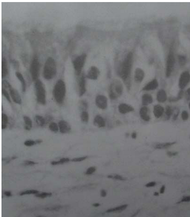
Figure 2 Ciliated Columnar epithelium over the grafted aorta.

Studies on prosthesis for repairing the tracheal defects have a long history beginning with Daniel's experiment in 1948. Since then, a variety of prosthesis has been used, but the results have been disappointing in a significant proportion of cases. In an extensive analysis of the litera-