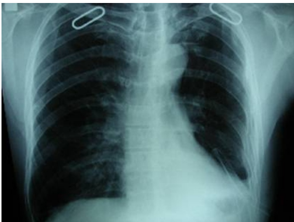
Figure 2 X-ray image of the other tube malposition patient. Despite the drain, retained haemothorax is observed.

nique TT due to high complication rates. The comparison of the patients who were performed classical surgical technique and the patients who were performed modified combined technique revealed significant differences in favor of the group that was applied modified combined technique with respect to TM and air leak.