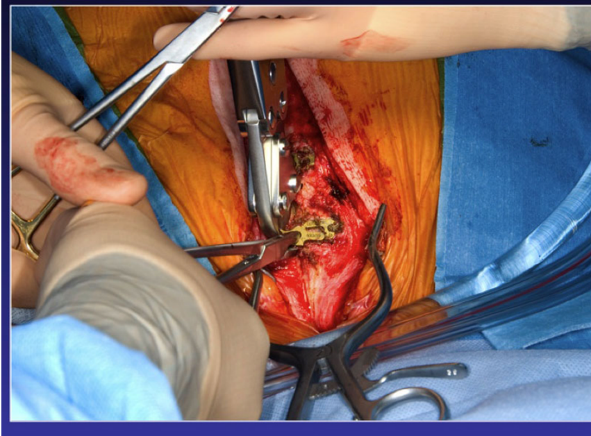
Figure 3 Titanium plate cut in the middle.