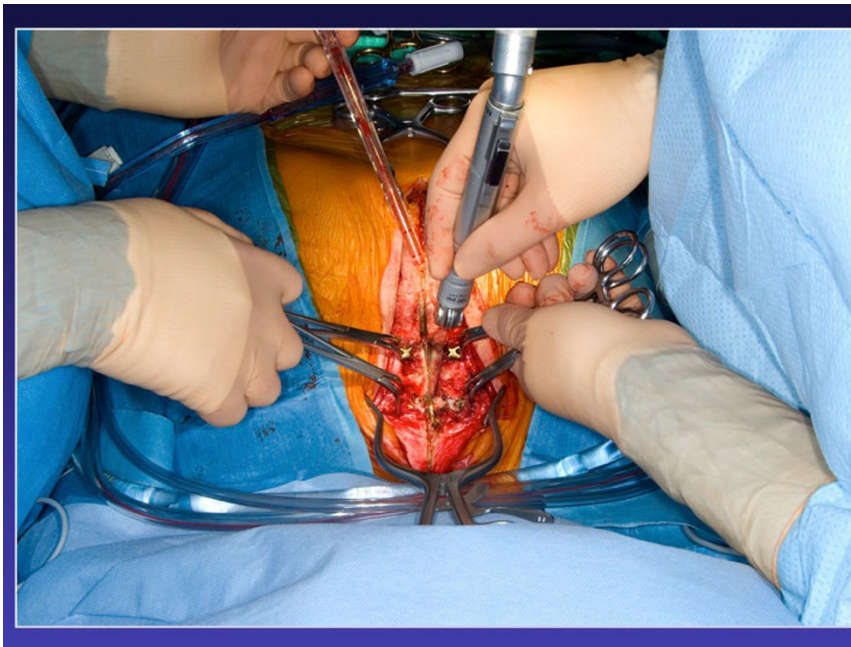
Figure 4 Titanium plate pull upward to help redo stenotomy with the oscillation saw.