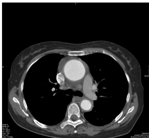
Figure 2 Thoracic CT from August 2004 - Thoracic CT from August 2004 showing an increase in the thickness of the aortic wall.

dissection or an intramural haematoma, aortitis was assumed. Arterial hypertension necessitated pharmacological therapy. Cephazolin, and later piperacillin-tazobactam were started, without any effect on the elevated CRP levels (20.5 mg/dl). Eventually, bilateral pleural effusions necessitated drainage. The pleural fluid showed a glucose content of 71 mg/dl ( \perp < 60 ), total protein of 4.0 g/dl ( \perp 0.3 - 4.1 ) and a LDH activity of 302 U/l ( \perp < 200 ), but no growth of bacteria or Mycobacterium tuberculosis . Cytological investigation of the pleural fluid revealed inflammatory cells