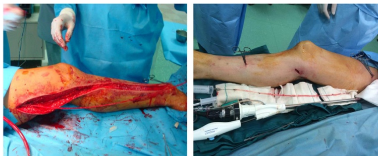
Figure 1 EVH and OVH procedure (EVH at right and OVH at left).