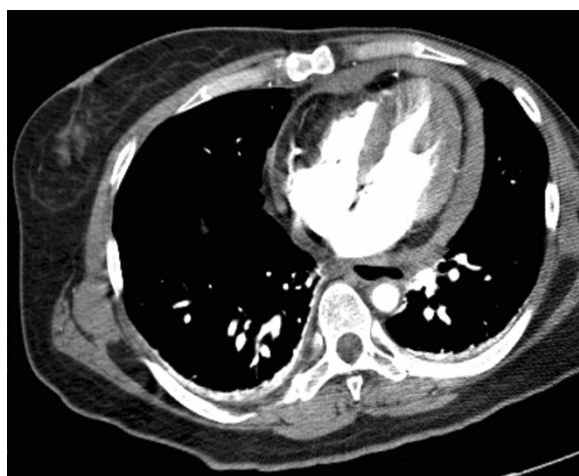
Figure 1 A computed tomogram demonstrated a pericardial fluid collection around the heart.

without the need for cardiopulmonary bypass. The postoperative course was uneventful and she was discharged four days after the operation.