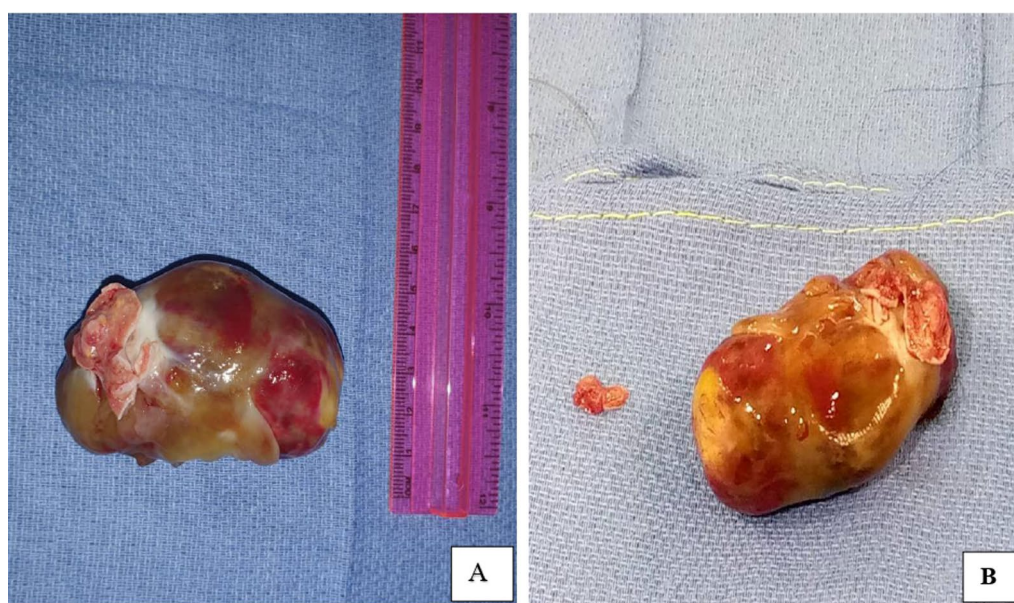
Fig. 2 Myxomas removed. Case 1 (A) and case 2 (B)