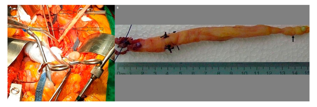
Fig. 2 A: Removal of the mass from the patient, sternotomy and laparotomy is seen (arrows), B: The mass is completely removed from the patient's veins

was de-aired, and the patient was rewarmed and weaned off CPB without complications. Post CPB, another TEE examination confirmed that the cardiac chambers were free from tumors.