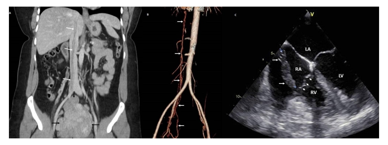
Fig. 1 A: CT, filling defect on lower vena cava and mass on uterus. B: CT reconstruction, the whole extent of the mass is seen. C: Echocardiogram, the mass is seen within the right atrium

Following this, a median sternotomy and cardiopulmonary bypass (CPB) were initiated to begin the thoracic approach. Once a deep hypothermic circulatory arrest was achieved, a veno-cavotomy was done in the infrarenal IVC, which allowed the complete removal of the 5\times1.5 cm tan-cream luminal mass from the IVC and iliac veins. The venacavatomy was closed in a one-layer fashion, and then attention was placed on the heart. The right atrium was exposed, and the 1.5\times14 cm whiteish solid mass was removed from the right atrium and inferior vena cava under TEE guidance. Once the tumor was removed, CPB was re-established. (Fig. 2A) The heart