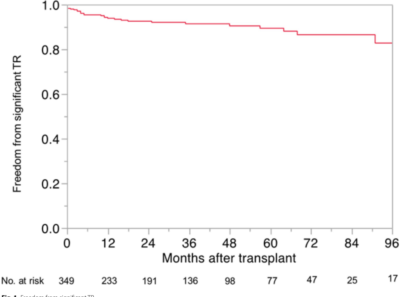
Fig. 1 Freedom from significant TR

Overall, the actuarial survival rate was 92.6% at 1 year, 86.2% at 3 years, and 83.8% at 5 years. The survival rate of patients in TR group was significantly lower than that of those in non-TR group; (5-year survival 54.6% in TR group, 86.7% in non-TR group; log rank < 0.01) (Fig. 2). In TR group, 11 out of 31 patients expired during follow-up. The causes of death in TR group were heart failure (n=4), respiratory failure (n=2), septic shock (n=1), sudden cardiac arrest (n=1), pulmonary embolism (n=1), and unknown (n=2). The Cox proportional hazard regression