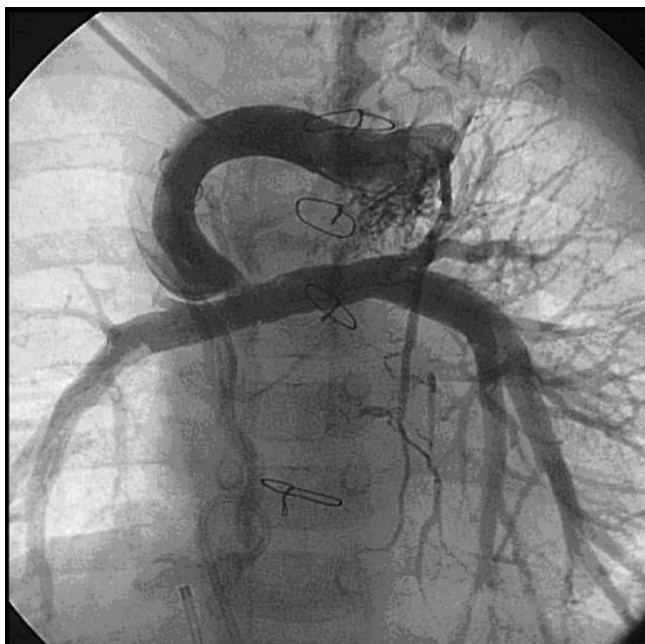
Figure 1 Preoperative angiographic finding. Focal stenosis between bilateral cavo-pulmonary shunt and pulmonary artery, numerous collaterals arised from both internal mammary arteries.

Under the median sternotomy and moderate hypothermia, standard technique for cardiopulmonary bypass was used with aortic and direct superior and inferior caval venous cannulation. The atrium was vented. We transected IVC and closed cardiac end of IVC with 5-0 prolene. IVC-extracardiac conduit anastomosis was done using 5-0 prolene following removal of previous confluent pulmonary artery conduit. Then both pulmonary artery hilums were enlarged with PTFE vascular graft using 6-0 prolene. Both pulmonary arteries were anastomosed with 12 mm PTFE vascular graft with 5-0 prolene, and SVC was connected with 6-0 prolene after creation of large opening. The heart was arrested for anastomosis of prepared fenestration site and right atrial wall. Patient was weaned from cardiopulmonary bypass smoothly. Total cardiopulmonary bypass time was 266 minutes and aortic clamping time was 21 minutes. An intraoperative transesophageal echocardiography showed wide and patent Fontan pathway with an adequate flow through fenestration.