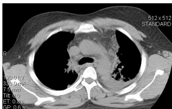
Figure 1 Thorax-CT of the patient indicating left hemothorax, left lung contusion in its posterior segments and a diffusing periaortic hematoma in the aortic isthmus area.

isthmus area and in the site of occluded ligamentum arteriosum, a local vestigial dilatation 0.5 \times 0.8 cm with normal endothelium lining was observed. Two stitches of prolene 4-0 reinforced with Teflon felt was used to obliterate this remnant. The aortotomy was then closed, the cardiopulmonary bypass was interrupted and the rest of operation was as usually. The patient was extubated after 8 hours and his postoperative course was uneventful. The patient underwent successfully on the 9 th postoperative day the surgical management of his right femur fracture and was discharged from the hospital on the 17 th postoperative day in good condition.