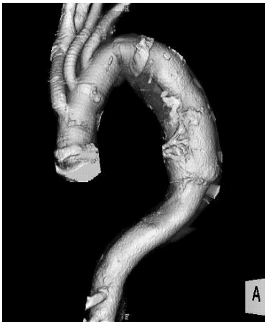
Figure 2 After total aortic arch replacement with an elephant trunk procedure.

In cases with multiple adjacent aneurysms, a single-step procedure is theoretically possible, but because of excessive invasiveness, surgical outcomes may be poor [2,3]. According to a report by the Japanese Association for Thoracic Surgery, the hospital mortality rate after arch-descending aortic replacement is significantly worse than after TAR (14.3% vs. 6.5%, p < 0.001 ) [2]. Kouchoukos et al [3] performed single-stage repair using a clam-shell incision in 46 patients and reported hospital death in only 3 patients (6.5%). However, 17% required a rethoracotomy for hemostasis, and other complications in survivors were reported, including mechanical ventilation for 72 hours or more in 42% (tracheotomy in 13%), and transient cerebral ischemia in 13%. On the other hand, when multistage surgery is selected to reduce surgical invasiveness, the surgical priority of multiple