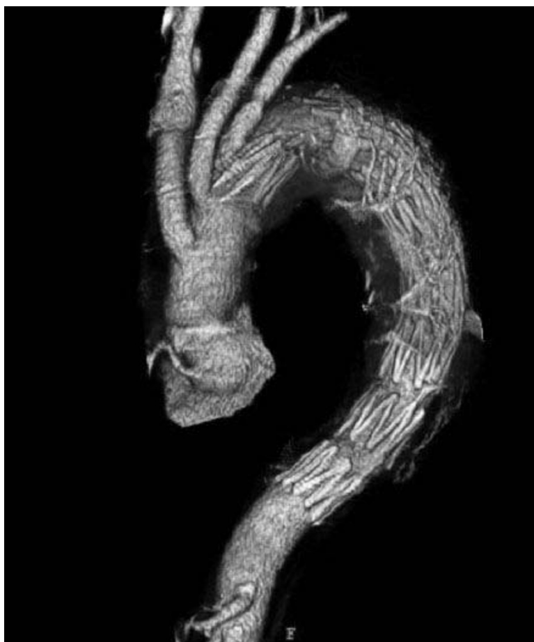
Figure 3 Second-stage TEVAR using the elephant trunk graft as the proximal landing zone.