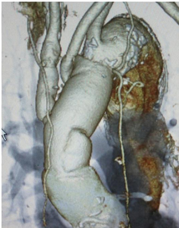
Figure 4 Postoperative 3-dimension computed tomography. There is no stenosis or dilatation of the branches.

detected. It may have been due to the long preoperative period of intravenous antibiotic therapy. The type of pathogen also affects the prognosis. A case who showed the colonized and damaged inner layer of the equine pericardial roll graft by methicillin-resistant Staphylococcus aureus was reported [7].