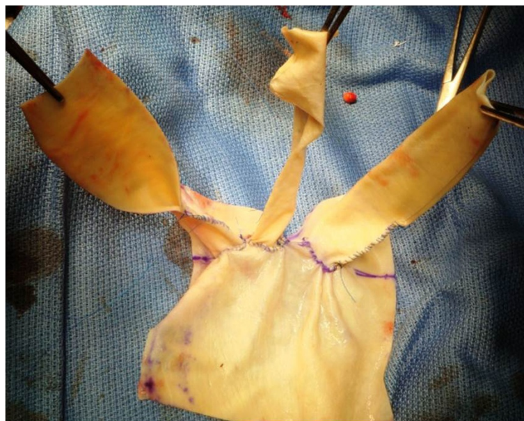
Figure 2 Three-branched pericardial sheet. Three holes, having a diameter of 10 mm, 10 mm, and 15 mm, respectively, were made. The holes were made 5 mm apart, and the last hole was made 20 mm from the edge of the sheet. Three rectangular sheets were cut from another pericardial sheet, and each of them was sutured to the circumference of a hole in the pericardial sheet and formed into a cylinder by continuous suturing with 5-0 polypropylene.

second middle branch was not used to reconstruct a vessel because native subclavian artery could be preserved, but it was used as an inflow root of the cardiopulmonary bypass. The main roll graft was clamped, antegrade perfusion was restored from the middle branch (Figure 3-B). While warming, the first proximal branch was anastomosed to the brachiocephalic artery. After completing the proximal anastomosis, the aorta was de-clamped (Figure 3-C). The aortic cross clamp time was 120 min,