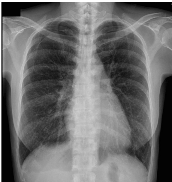
Figure 2 Chest plain film showed right pneumothorax with cystic change.

melanoma block (HMB)-45. Therefore, the diagnosis of LAM was confirmed. The post-operative course was smooth and she was discharged 4 days after the operation. Till now, she had been followed up in our outpatient department for 32 months without recurrent pneumothorax.