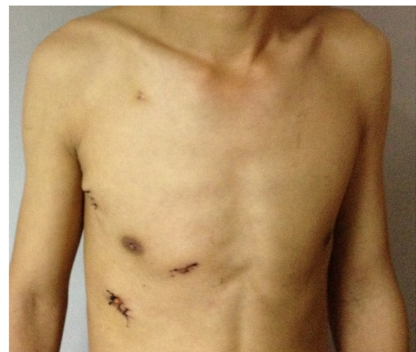
Figure 2 The incisions in the chest.

simultaneously both the superior and the inferior vena cava during the operation [7]. The pericardium was incised, and the free edges suspended conventional under the guidance of the thoracoscopy. The cardiopulmonary bypass was established with standard procedure as reported [8,9]. A long aortic cross-clamping forceps was placed directly on the ascending aorta, and a cannula for delivery of cardioplegia was inserted to the aortic root both through the incision 2. After the heart was arrested, the right atrium was opened along the site parallel to the atrioventricular groove by the forceps and scissor through the incision 2 and incision 3, respectively. The ASD was closed with 4–0 prolene (Ethicon) directly or with self-pericardium patch based on the size of the defect (Figure 2). Deairing was done from the cannula for delivery of cardioplegia and the ASD defect before knotting by lung inflation. The right atrium was sutured by 4–0 prolene (Ethicon) after the aortic clamp released and body warmed. After withering