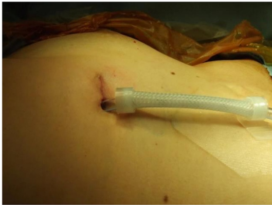
Figure 2 Single port right upper lobectomy with only 2.5 cm skin incision.

Table 4 showed age, operation time, length of postoperative hospital stay, postoperative complication, follow-up period, early outcome according to each SITS procedure. Operation time and hospital stay in the patients with simple pulmonary wedge resection including pneumothorax, interstitial lung disease, or solitary pulmonary nodule were shorter than other SITS procedures. In contrast, lobectomy showed the longest operation time, and decortication patients had the longest hospital stay. Postoperative complication occurred in 7 (7/237 = 2.95%) patients. One PSP patient underwent hematoma evacuation due to postoperative bleeding from parietal pleura after pulmonary wedge resection and mechanical pleurodesis. One patient had air leakage for more than 3 days. Two patients had wound dehiscence, which was solved with skin stapler. One patient who underwent left lower lobectomy readmitted due to increased pleural effusion and was treated with 12 French mini-chest tube insertion. One PSP patient with bilateral multiple bullae had wound infection and contamination of thoracic cavity after receiving operation on both sides. This patient was originally transferred to our hospital on the 7 th day of chest tube insertion from the other hospital because he had prolonged air leakage with moderate subcutaneous emphysema. We believe this may have led to