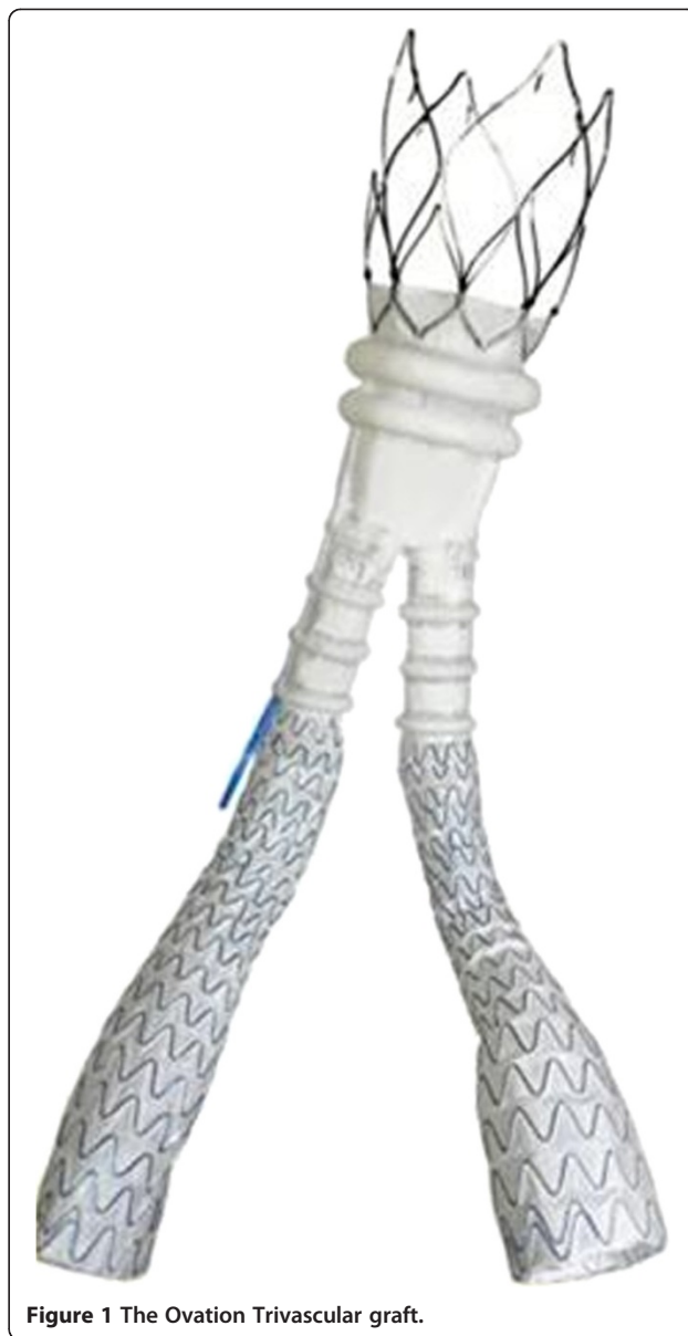
Figure 1 The Ovation Trivascular graft.

The polymer is radiopaque, allowing the filling of the graft to be observed under fluoroscopy. Once the main body of the graft is positioned and opened, the polymer is prepared on the operating table, and mixed in a syringe that will be joined to the graft introducer. The syringe itself is joined to an autoinjector which pushes the polymer through the ring-shaped channels in 20 minutes, during which it is possible to complete the placement of the contralateral iliac extension. When the time of the