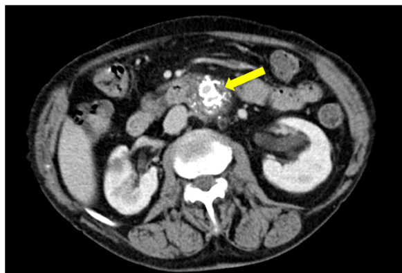
Figure 2 CT-angiography control at 6 months. The arrow indicates the slight narrowing of the iliac legs of the graft.

are still observed, such as dissections, arterial ruptures and haematomas in case of percutaneous approaches. Reduced access site complications and lower overall procedural mortality rates after EVAR have been recently reported with the use of new lower-profile endograft systems [2-5].