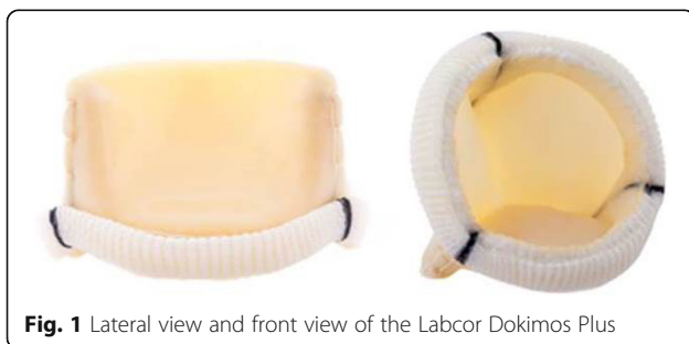
Fig. 1 Lateral view and front view of the Labcor Dokimos Plus

After approval by the local Ethics Committee pre-, intra- and early postoperative (until discharge) data were prospectively collected. Hemodynamic performance was evaluated using transthoracic echocardiography at discharge. It was performed with a GE Vivid 7 Dimension (General Electric, Fairfield, Connecticut, USA) to check morphology and function of the implanted prostheses.