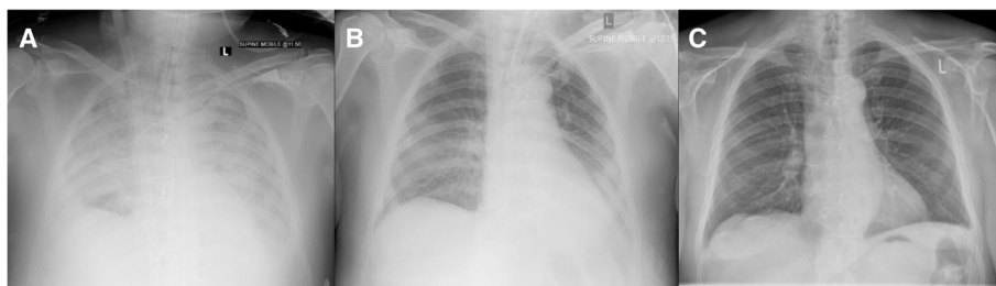
Fig. 2 Chest X-Rays performed: (a) after VV-ECMO insertion: patchy airspace of opacification bilaterally. Features in keeping with ARDS; (b) 6 days after VV-ECMO insertion, immediately before weaning: significant improvement in the bilateral perihilar pulmonary infiltrates; (c) at three-months follow up: heart size normal, lungs and pleural spaces clear

First of all, the cause of respiratory failure is known (such as aspiration pneumonia in our case). Moreover, the patients are already in a centre for advanced respiratory failure management, and institution of ECMO can be done early. Furthermore, the cardiac function is normal, unlike elderly patients from the community who may have cardiac disease. Finally, co-morbidities like malignancy have already been ruled out.