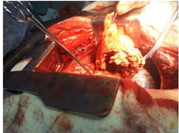
Fig. 3 The presence of an old and degraded piece of surgical swap intrapericardial

with the capsular layer of this mass. Patient tolerated the procedure very well and blood loss was minimal. A chest tube was inserted in the left hemithorax and chest wall was closed following standard procedures.