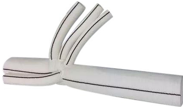
Fig. 2 The 4-branched vascular graft (10 × 8 × 8 × 10 mm)