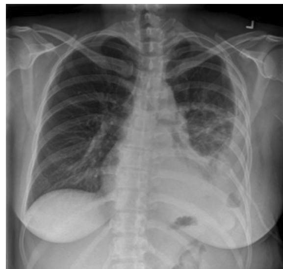
Fig. 2 CXR following drainage of the left pleural effusion

accepting the potential risk of bleeding and possible fetal complications. One dose of 5 mg of tissue plasminogen activator (tPA) diluted in 50 ml of normal saline was given, after which a significant drainage of the left pig tail was noticed. A fetal ultrasound following the administration of intrapleural fibrinolytics was reassuring.